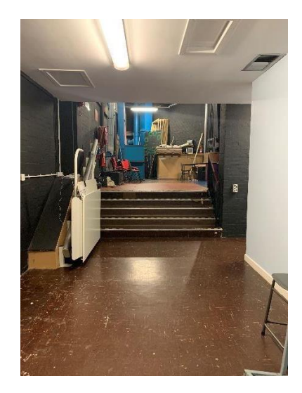
Mains Power 63A 3Ph and view of the stage bars (dressing rooms to the left in the direction of the arrow)